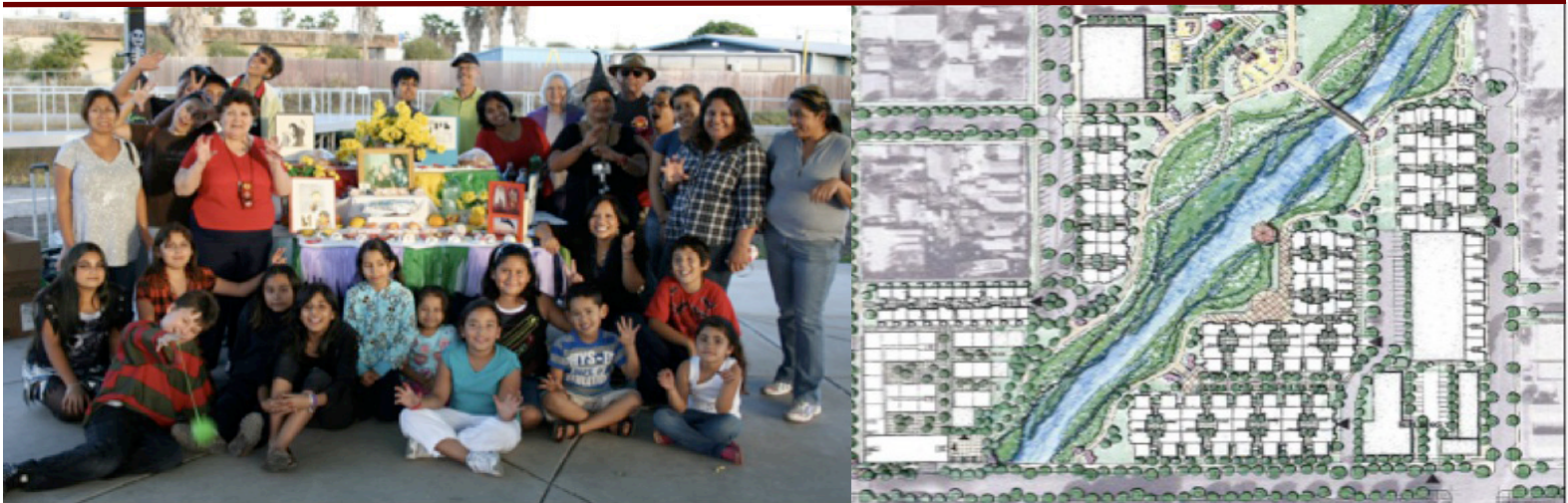
Community leaders from the Environmental Health Coalition plan their vision for a "Green Zone" in National City, CA.

This vision can become a reality through the California Environmental Justice Alliance (CEJA)'s Green Zones Initiative. We believe that by improving conditions for those most impacted by pollution and poor planning, we can improve conditions for all of California. With overburdened communities leading the way, communities, government, and businesses can collaborate to transition toxic hotspots into thriving Green Zones. Together, we can cultivate dozens of vibrant communities and advance visionary policies, so Green Zones can become a model for strengthening local economies, environments, and democracies across California and the country.