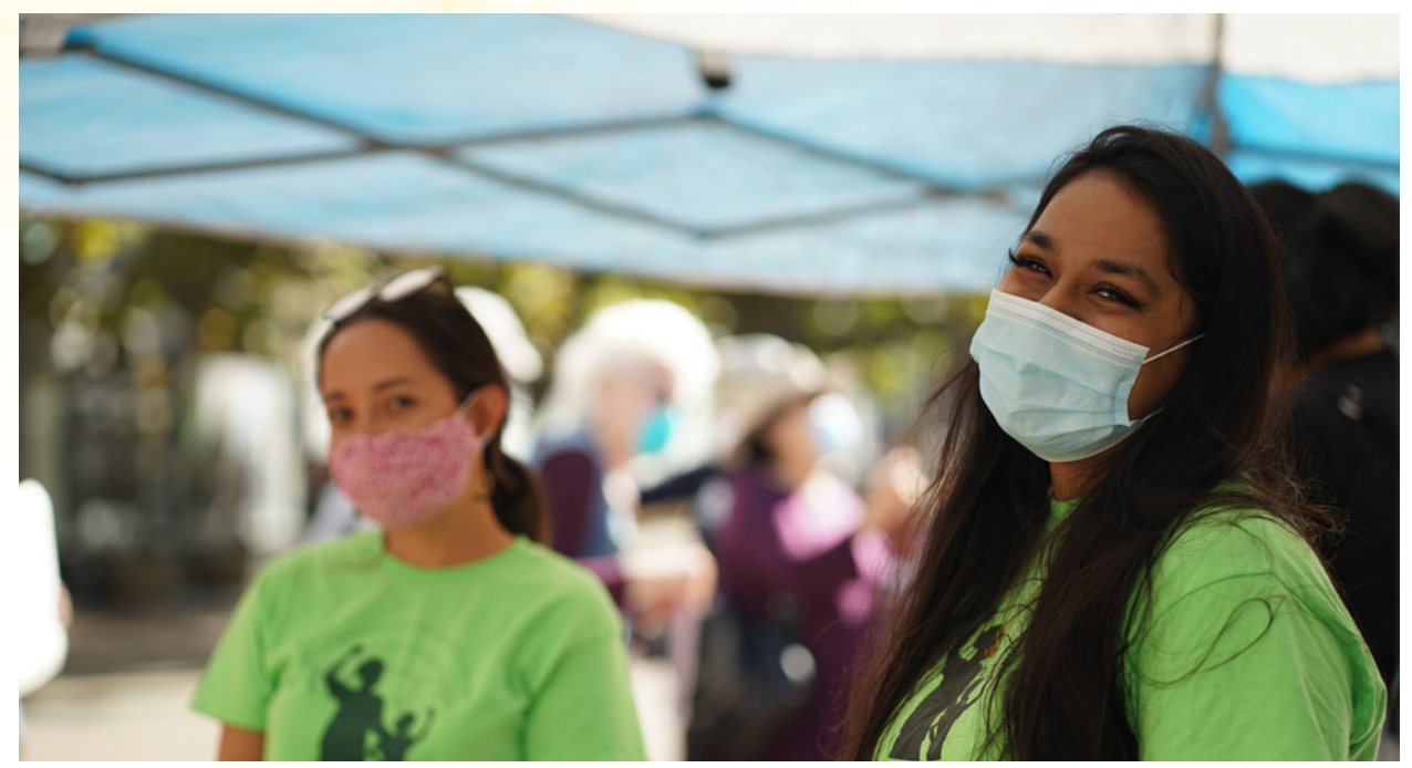
APEN staff at November Count Every Vote Rally