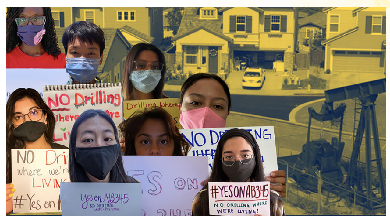
CEJA members and partners take social media action for health and safety buffer zones