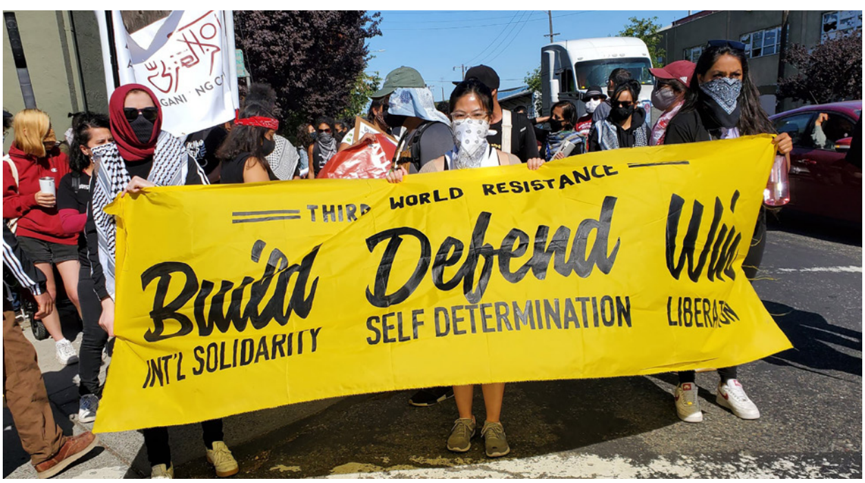
APEN staff join other members of the Third World Resistance at June 3rd #DefundOPD protest

As climate disasters intensify and racial inequities widen, there is an urgent need for environmental justice leadership in California. People of color are the new majority in our state, and will soon be the majority across the nation. Our legislators must meet the moment by passing policies to protect the health, safety, and economic welfare of our state's most vulnerable communities.