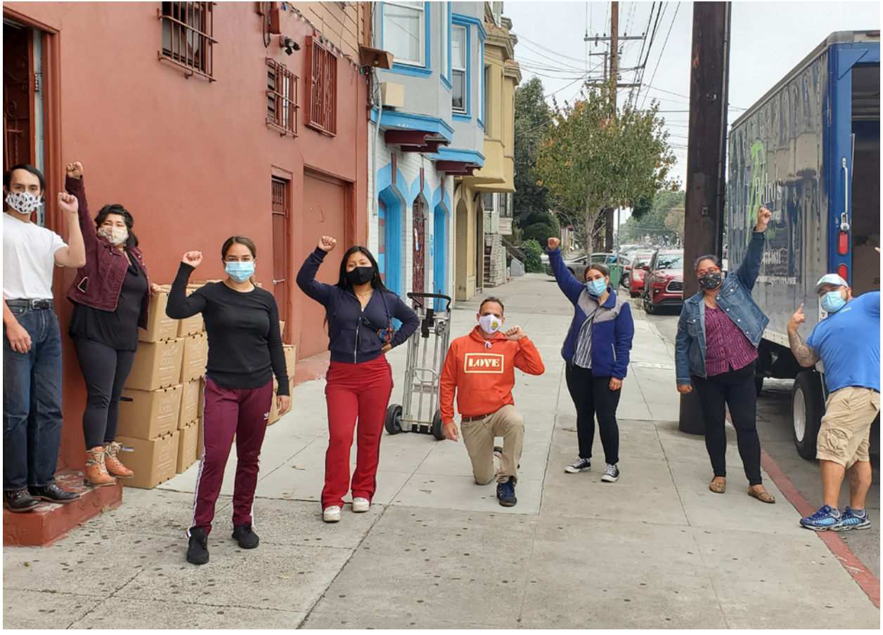
PODER members and staff prepare to deliver mutual aid for COVID-19 relief in the Mission