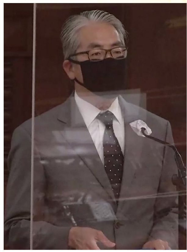
Assemblymember Muratsuchi presents AB 345 in the Senate Natural Resources Committee on Aug. 5, 2020