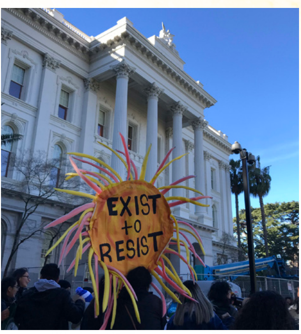
February 2020 launch of Regenerate California campaign

While voting records still compose the overwhelming weight of the scores, we hope that Community Points serve as a reminder that when it comes to environmental justice, a representative's job goes well beyond casting votes.