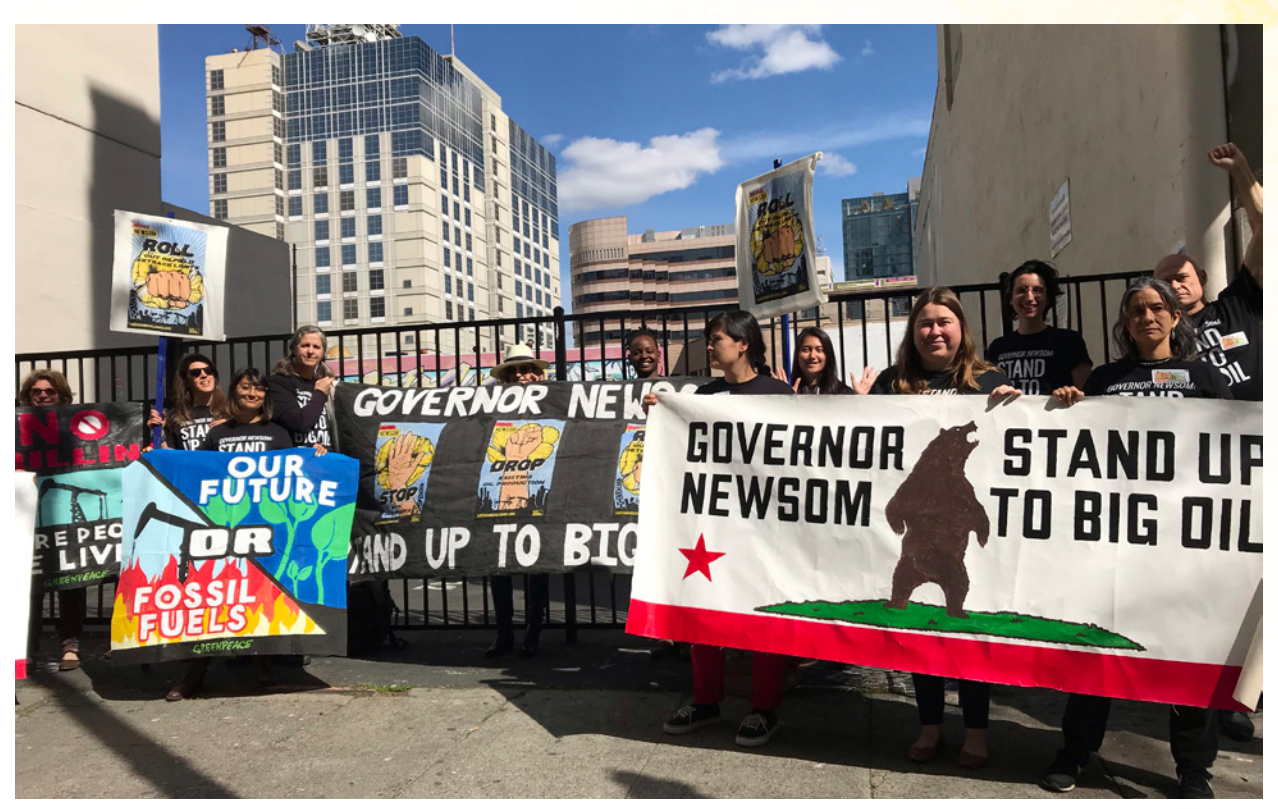
CRPE and CEJA members at an Oakland CalGEM rulemaking.