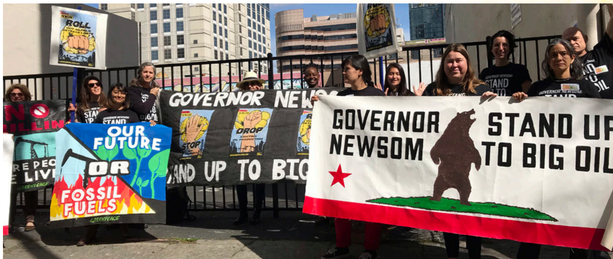
CRPE and CEJA members at an Oakland CalGEM rulemaking.

Governor Newsom also signed AB 3163 (Salas), a bill that further fuels the myth that biomethane is a sustainable fuel. The bill allows for costly, ineffective production of methane with no regard for methane leakage, combustion emissions, the need for a long-term infrastructure transition, and harmful local impacts.